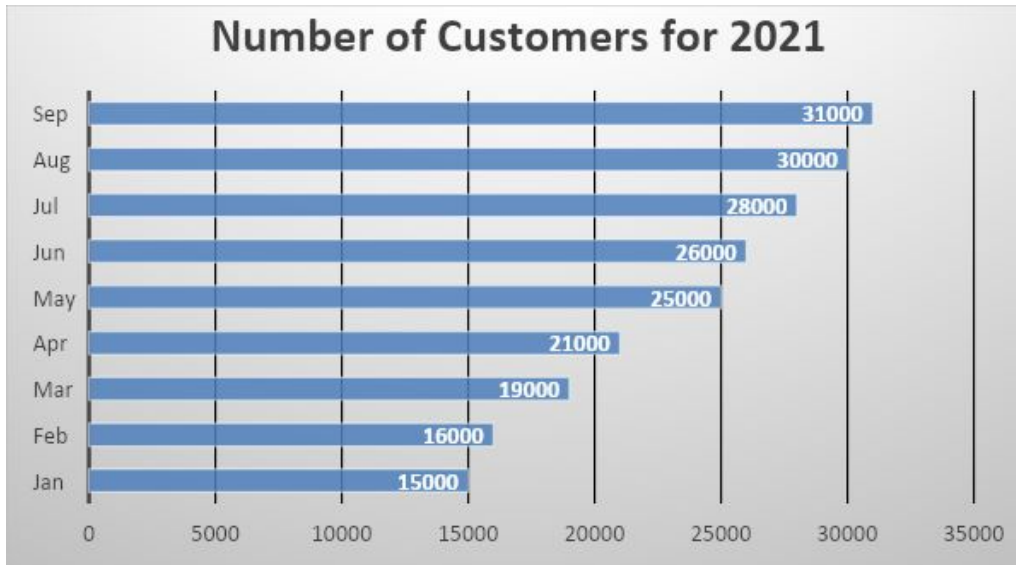
Number of Customers for 2021